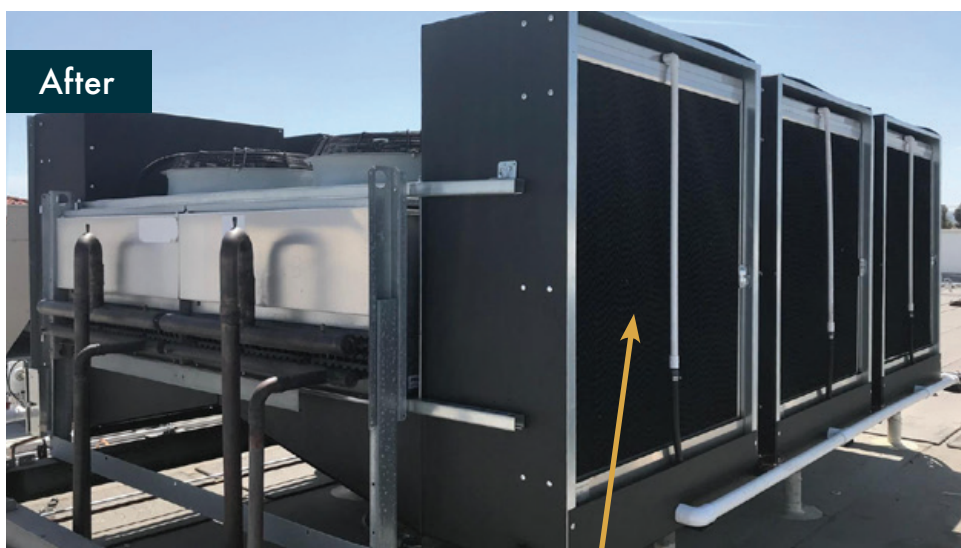
Direct evaporative cooling module with Munters filter screen keeps condenser coils clean.